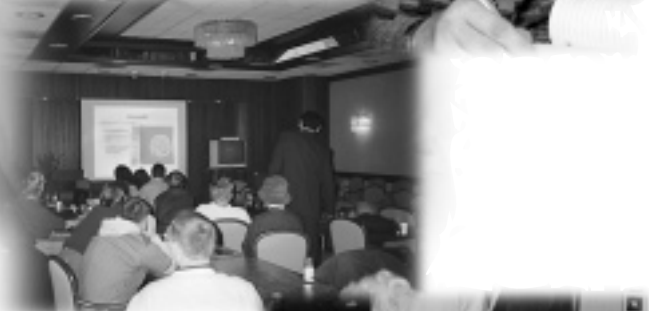
Learning with each other