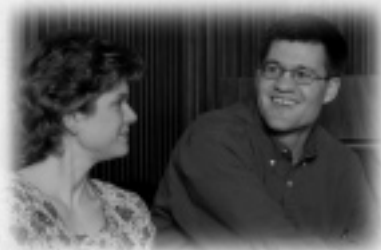
Sharing with each other

The Southwest Ohio Brain Tumor Support Group was founded in 1994 by a young woman with a brain tumor and is sponsored by the Wallace-Kettering Neuroscience Institute. The group encourages patients, family members and friends to gather and share their experiences and emotions about coping with the disease and its effects. Meetings are led by an experienced professional and provide an opportunity to learn about treatment, research and recovery. Occasionally, a guest speaker is featured.