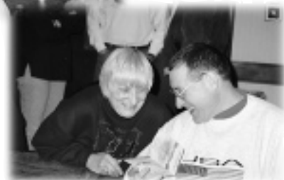
Being with each other